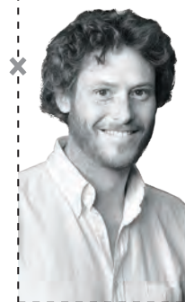
RIGHT: SHUTTLESTOCK (4)